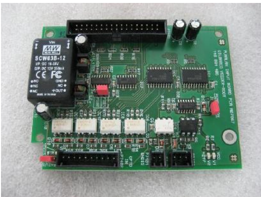
SK7202 PIB BOARD