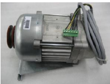
SK7027 motor 0,75kw