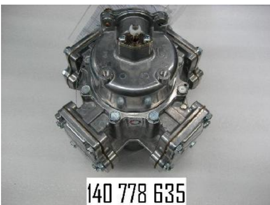
GBL196 TAPPO 1"