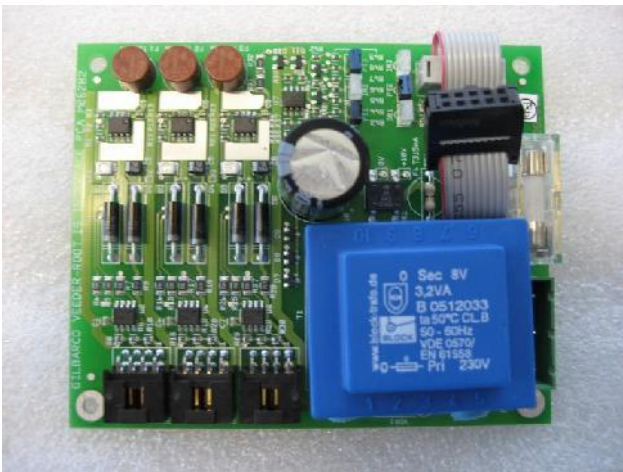
Sk7117 IS BARRIER